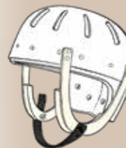
3470 EYEGLASS RELIEF AREA