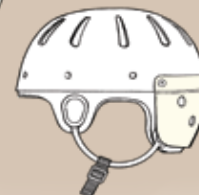
3465 REAR HARD SHELL EXTENSION