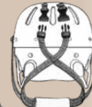
3472 CUSTOM STRAPPING SYSTEM